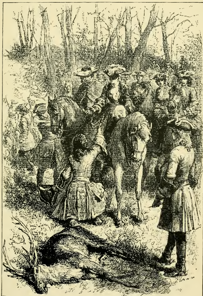
Miss Ashton refuses the huntsman's knife.